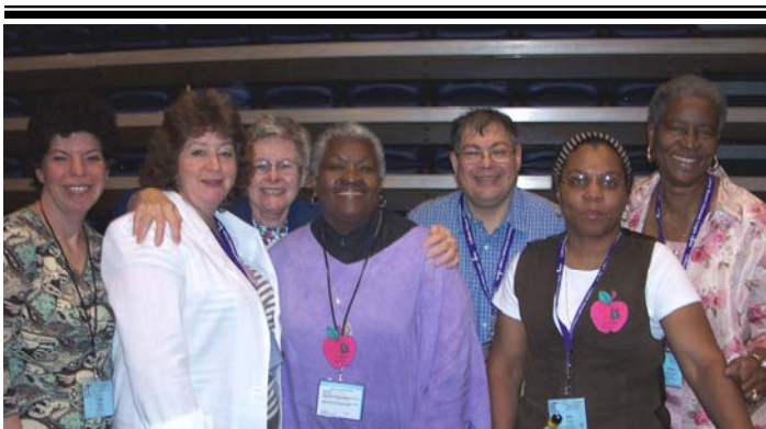
Atlantic District Delegates